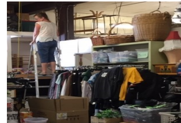
The sorting and storage area at Care Closet