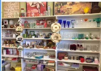
Display ready for Fall changeover day

Regardless of where you help out, the work of volunteers is important to the health and well being of our community.